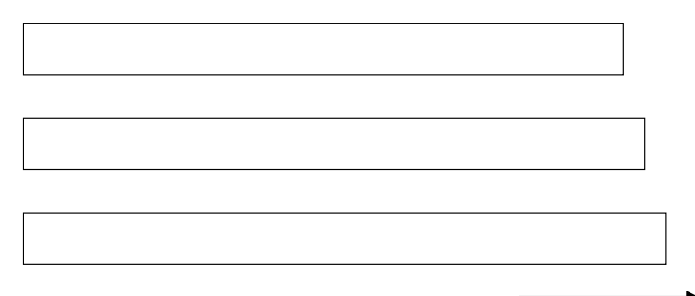
Figure 1: Possible differences in the OFDMA symbol duration

nominal symbol duration of 112.044\mu secmaximum symbol duration of 114.285\mu secminimum syml