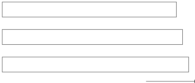
Figure 1: Possible differences in the OFDMA symbol duration

nominal symbol duration of 112.044 \mu\text{sec} maximum symbol duration of 114.285 \mu\text{sec} minimum symbol