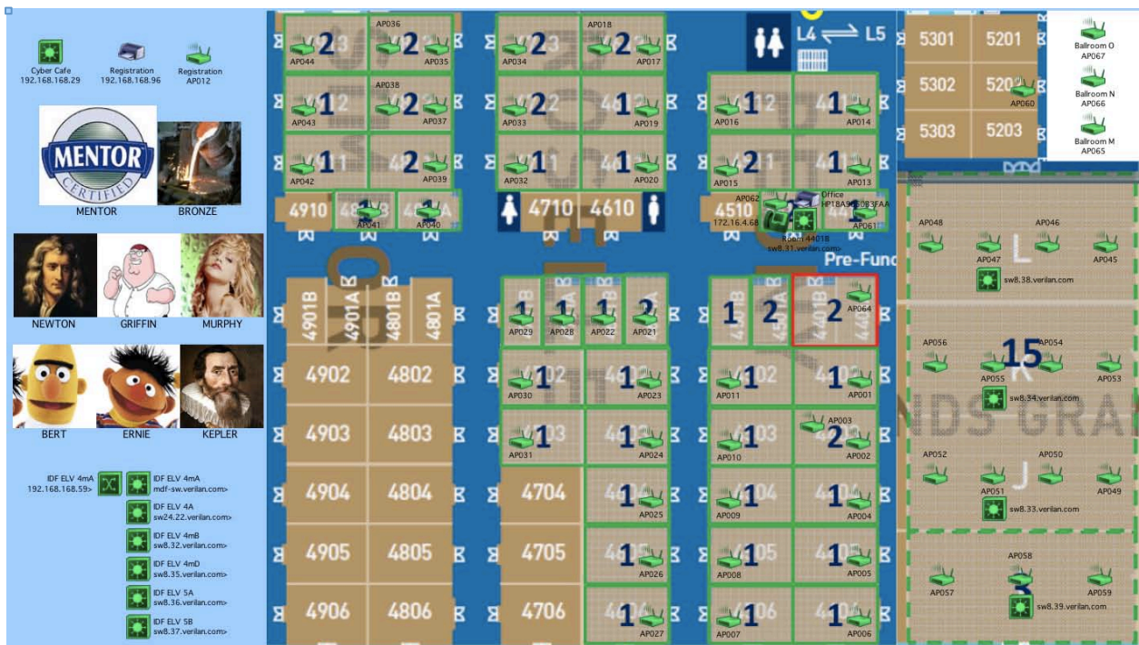
Figure 5. Wireless Access Point Deployment Plan

Verilan deployed 64 enterprise grade tri-modal IEEE 802.11a/b/g wireless access points throughout the MBSCC to provide coverage for all meeting spaces. Verilan is providing both Open and Secure (802.1x) networks to registered attendees. Figure 5. illustrates the location of the WAP deployments.