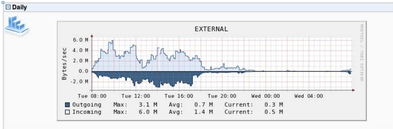
Figure 2. Internet Usage: past 24 hours (CST)