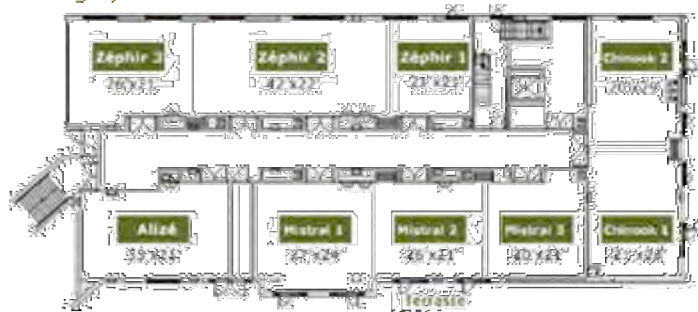
Étage / 1st Floor