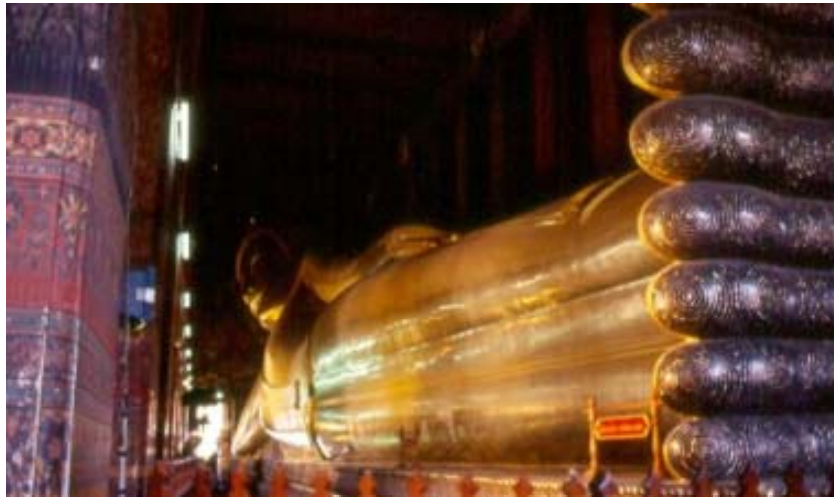
Pra non (Sleeping Buddha)