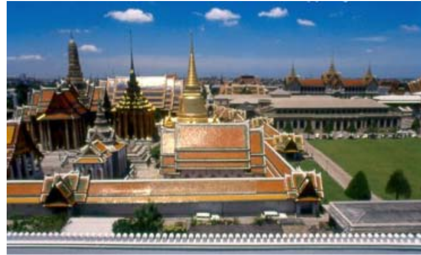
Wat Prakeo (Emerald Buddha Temple)