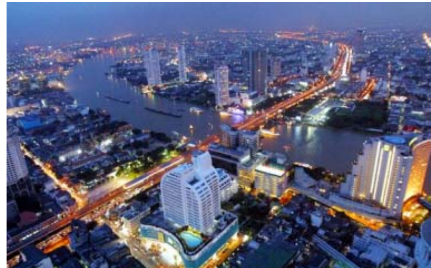
City at Dusk