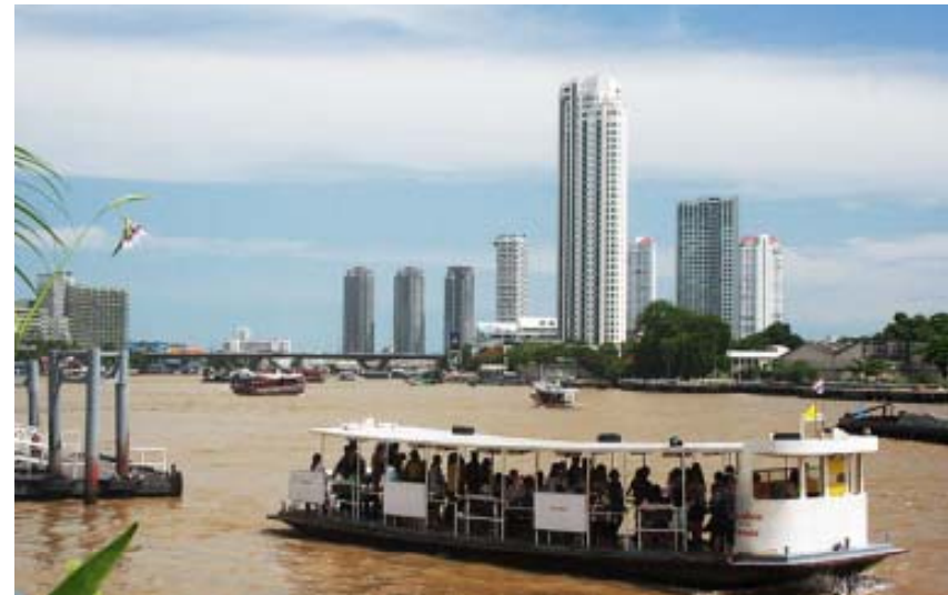
Chao Phraya River