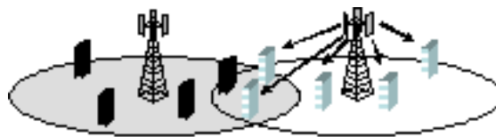
Figure h52—Policy instructions to the slave SSs by the slave BSs