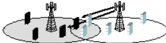
Figure h56—Detection and identification of the SATIs content by the master SSs

During this step ( Detection and identification of the SATIs content by the master SSs ), the master SSs in the overlapping area between-of the master systemcell and their slave systemcell listen to the different SATIs sequentially. For each slave systemcell , these master SSs can get the information contained in the SADD message.