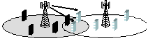
Figure h53—Detection and identification of the MATIs content by the slave SSs