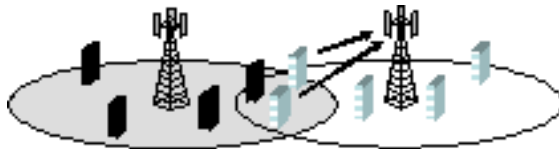
Figure h54—Relaying of the MATIs content to the slave system cell by the slave SSs