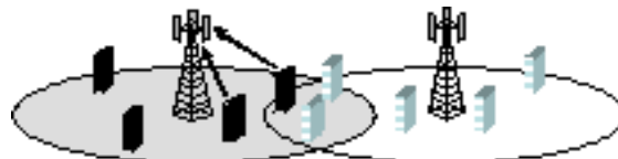
Figure h57—Relaying of the SATIs content to the master systemcell by the master SSs