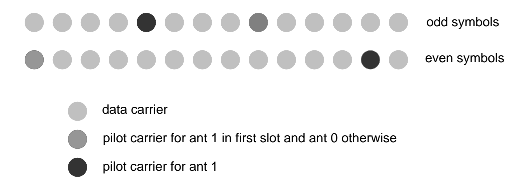
Figure xxx- Cluster structure for First-zone STC.

The pilot tones in the first slot (first two OFDMA symbols after the preamble symbol) shall be transmitted by antenna 1 for use in channel estimation. Thereafter the pilot tones are divided between antenna 0 and 1. Modulation of pilot tones are depicted in Figure yyy.