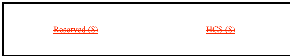
Figure 20x—MBS Preferred DIUC Feedback header without CID field

The MBS Preferred DIUC Feedback header shall have the following properties: