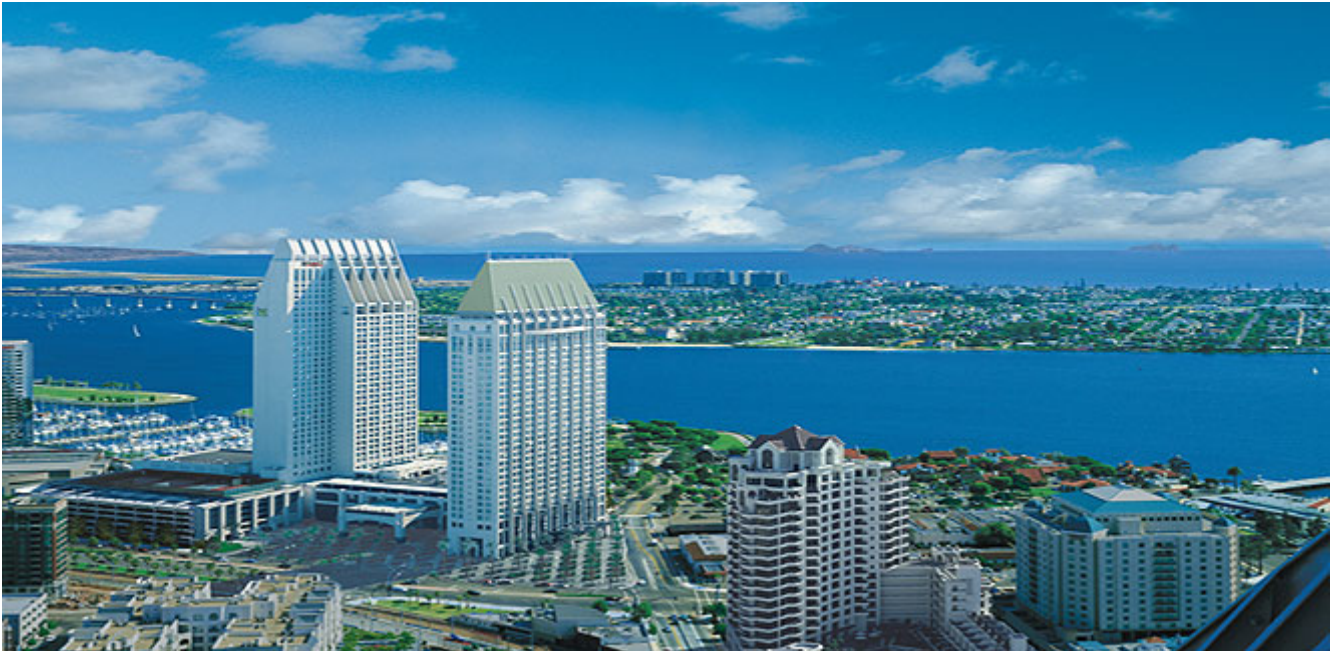
Manchester Grand Hyatt Hotel, San Diego

http://manchestergand.hyatt.com/hyatt/hotels/index