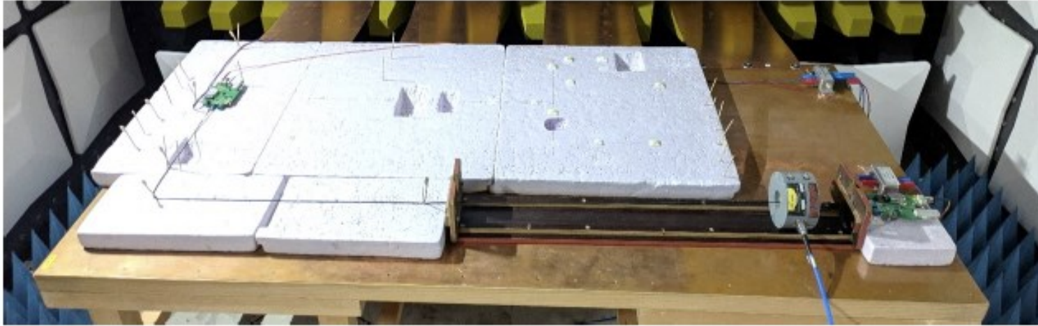
Test set-up, complete arrangement for test channel 2 (2 m), Deserializer is DUT